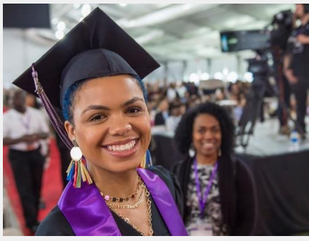
SA Aspirational Best Practices

<u>SA Priority Alignment with Strategic Plan (SP):</u> Goals 1.2.3