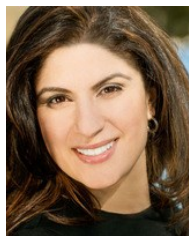
Nadia Hashimi, Author

An American political analyst, Thomas Frank is the noted author of Pity the Millionaire , The Wrecking Crew , and What's the Matter with Kansas?